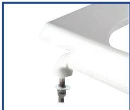
External check hinge with 304 stainless steel hinge posts